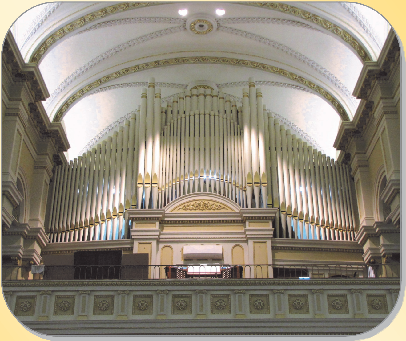
Jacox Memorial Pipe Organ St. Patrick Church

Thirtieth Sunday in Ordinary Time October 28, 2018