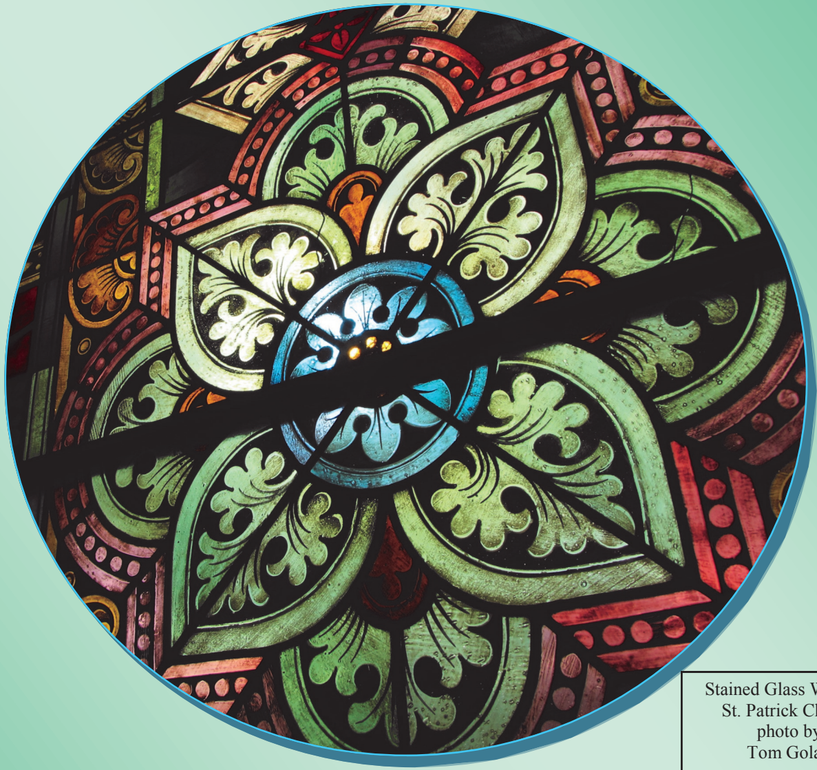
Stained Glass Window St. Patrick Church

Nineteenth Sunday in Ordinary Time August 11, 2019