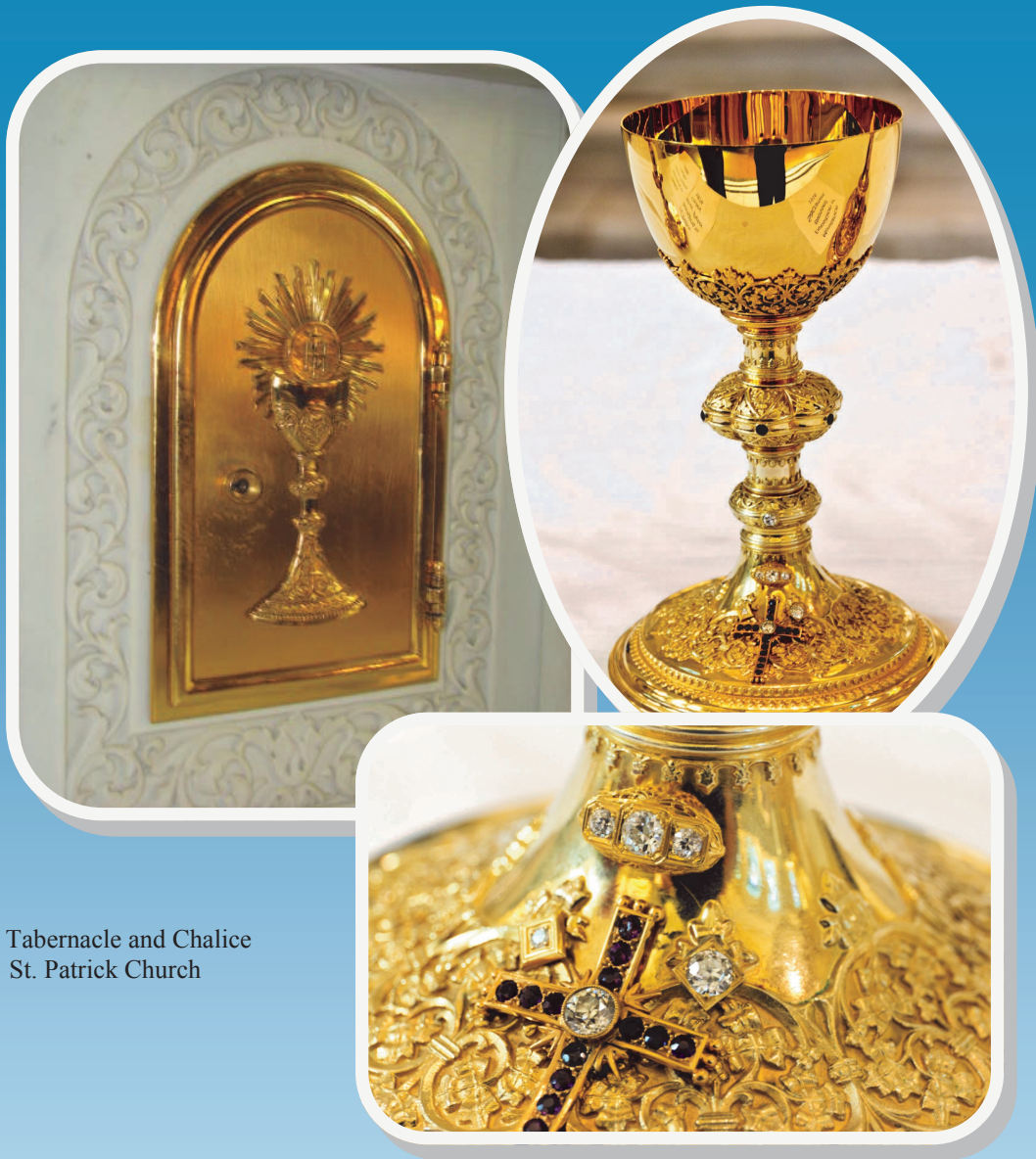
The Tabernacle and Chalice St. Patrick Church