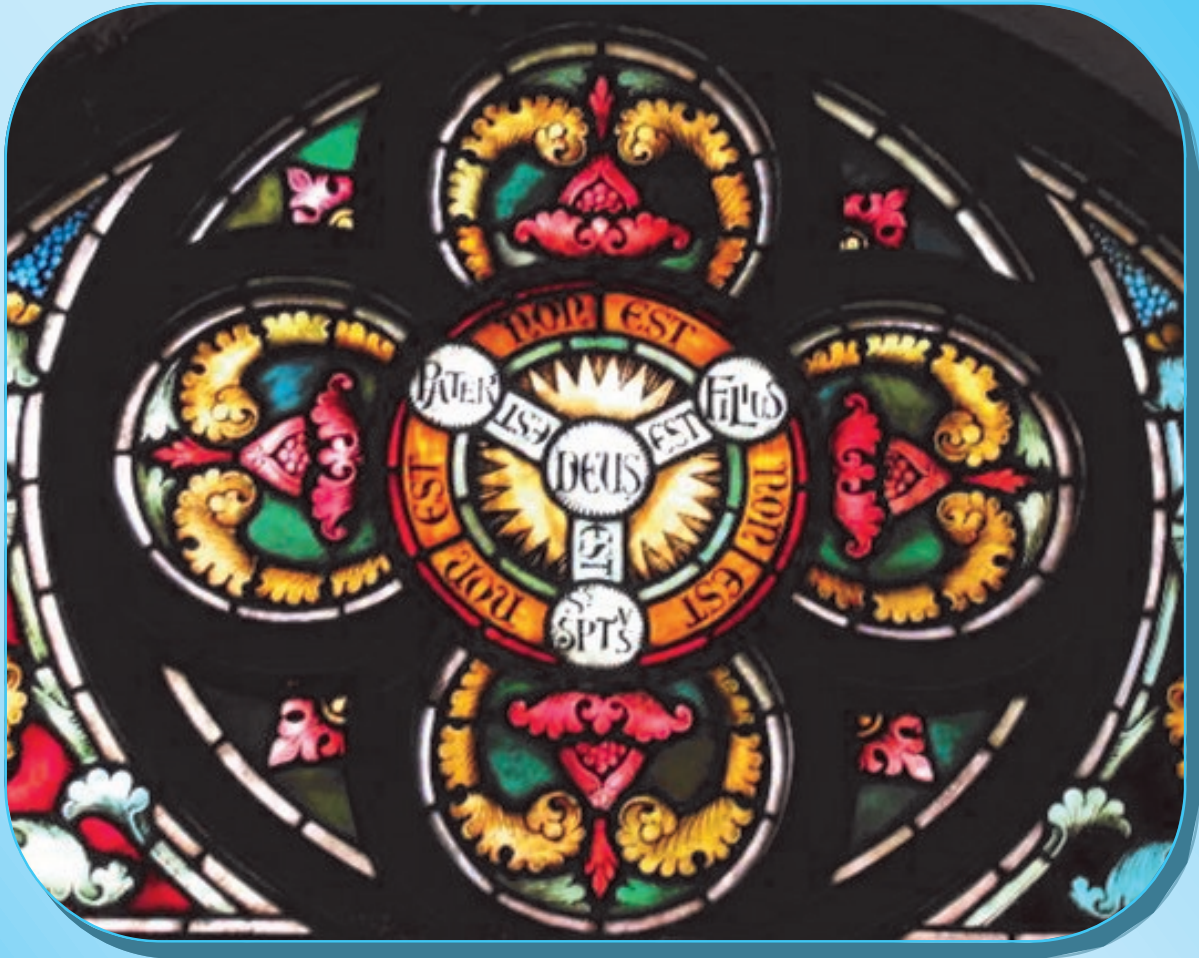
The Holy Trinity Stained Glass Window St. Patrick Church